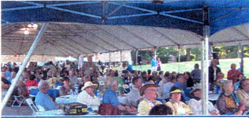
During the Chicago Convention, our District hosted a party with the Hinsdale Rotary Club for more than 400 Rotarians from around the world