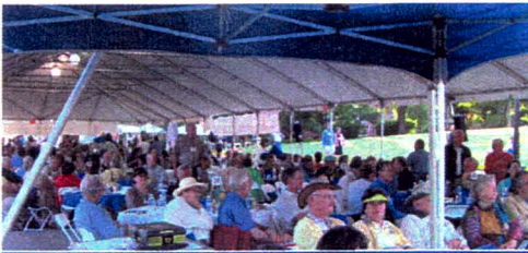
During the Chicago Convention, our District hosted a party with the Hinsdale Rotary Club for more than 400 Rotarians from around the world