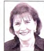
4-WAY TEST IVY PATE