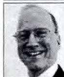
INVOCATION HARLAND MERRIAM