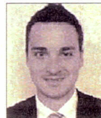
INVOCATION QUINCY BIRD