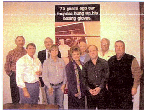
ROTARY GOES TO WORK