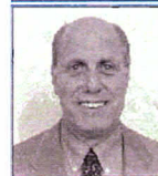
INVOCATION MICHAEL CLAYTON