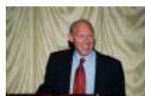
Sep 08, 2010 Mayor Bill White Candidate for Governor of Texas "Vision for Texas"

The Rotary Club of Beaumont has extended a speaking invitation to both candidates for governor. Former Houston Mayor Bill White will speak to us on September 8th.