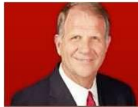
Ted Poe Texas Congressman

A favorite speaker with our members, Congressman Poe comes to speak to us, once again as our Congressman, until the mandated redistricting takes effect on January 5, 2013.