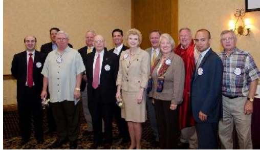
Centennial Board of Directors