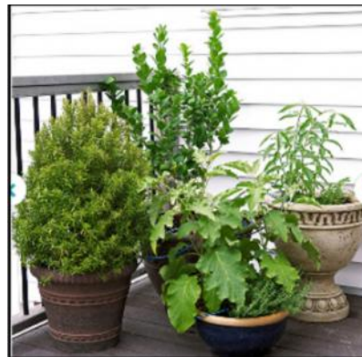
Tim Schreck Master Gardener

"Container Vegetable Gardening in Southeast Texas"