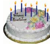
Bel Lamb May 5