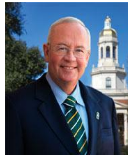
Ken Starr President Baylor University

Kenneth W. Starr is the 14th president of Baylor University. Judge Starr has had a distinguished career in academia, the law, and public service. Prior to coming to Baylor, he served for six years as the Duane and Kelly Roberts Dean and professor of law at Pepperdine University School of Law, where he taught current constitutional issues and civil procedure. He has also been of counsel to the law firm of Kirkland & Ellis LLP, where he was a partner from 1993 to 2004, specializing in appellate work, antitrust, federal courts, federal jurisdiction and constitutional law.