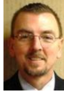
Pledge to the USA & Texas Flags - Craig Lively , City Judge, City of Beaumont