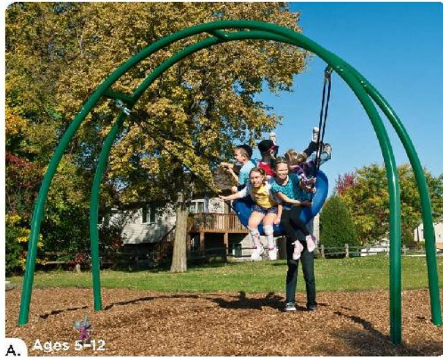
A. Ages 5-12