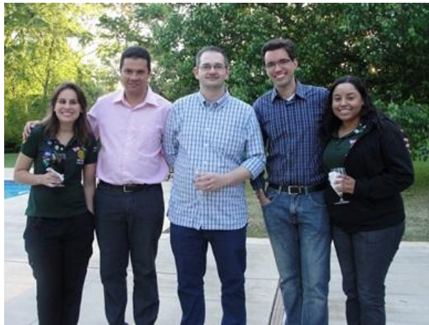
Team at Welcome Dinner in Beaumont on April 9.

“We had a great time in Beaumont and the cities around it! Not only we saw wonderful things like the Museum at Port Arthur, Shangri-la in Orange, all the team had amazing vocational days! All of us came back with more knowledge in our business area. Loved the multi-club meeting! And the barrier-free for all children Beaumont Rotary Playground Project is fabulous and I will show that in all our clubs in our District, that is for sure! And all the families that hosted us and those who joined us for the day were so kind and careful with us. We can't thank y'all enough!