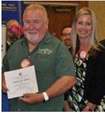
Manager for Sour Lake Motor Company-Sour Lake Truckville.