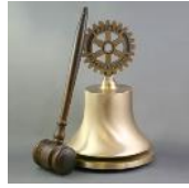
Benefiting the Beaumont Rotary Foundation

Ever wish you had the opportunity to ring the opening bell at the meeting?