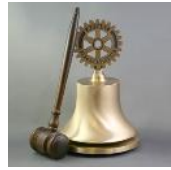
Benefiting the Beaumont Rotary Foundation