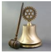
Benefiting the Beaumont Rotary Foundation

Ever wish you had the opportunity to ring the opening bell at the meeting?