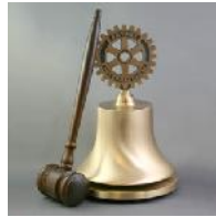
Benefiting the Beaumont Rotary Foundation

Ever wish you had the opportunity to ring the opening bell at the meeting?