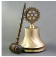
Benefiting the Beaumont Rotary Foundation

Ever wish you had the opportunity to ring the opening bell at the meeting?