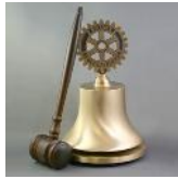
Benefiting the Beaumont Rotary Foundation

Ever wish you had the opportunity to ring the opening bell at the meeting?