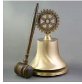
Benefiting the Beaumont Rotary Foundation

Ever wish you had the opportunity to ring the opening bell at the meeting? For a donation of $25 to the Beaumont Rotary Foundation, you will be allowed to do just that. You will be called up to ring the bell to start the meeting!