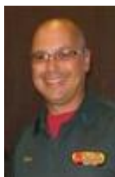
Bill Clark Pest Control, Inc.