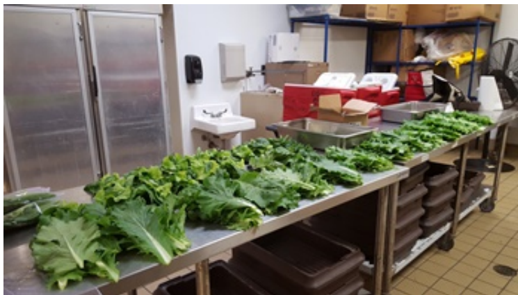
The first harvest is plentiful!