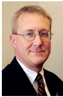
Better Business Bureau of Southeast Texas