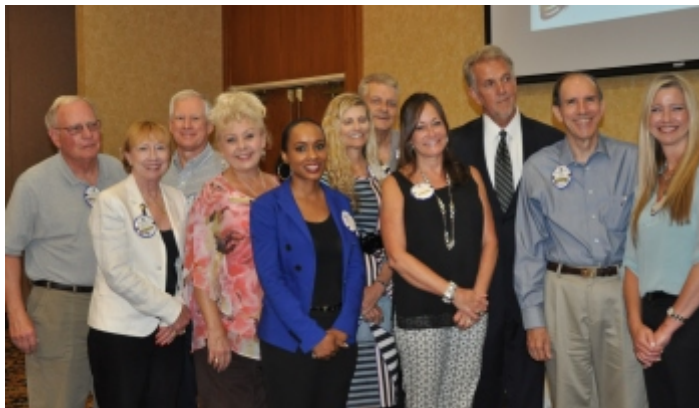
2016-17 Elected Board of Directors