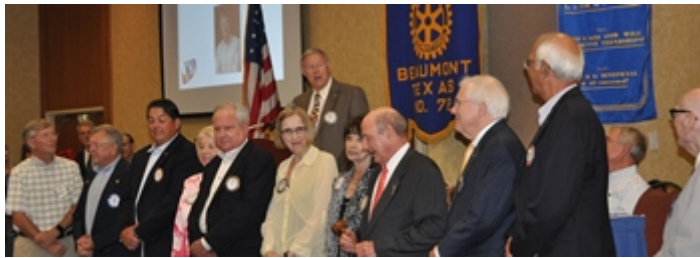
A most impressive group of Past Presidents