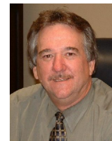
Eddie Arnold November 26