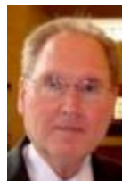
Earl Hines October 18