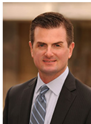
Brandon Creighton State Senator

"Brandon began his public service in college, when he served as a messenger in the Texas Senate. After learning the value of hard work on his family ranch outside Conroe and working to fund his own education, he has applied his work ethic to a succession of roles. After serving as a policy advisor in the Texas Senate, he worked for the Attorneys General in both Texas and Oklahoma. Voters in Montgomery