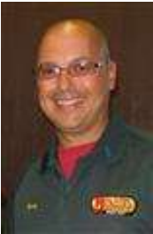
Bill Clark Pest Control, Inc.