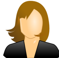
Polly Matlock September 3