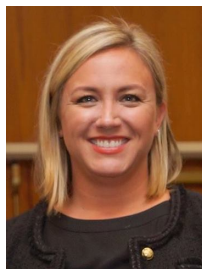
Financial Advisor Morgan Stanley Wealth Management