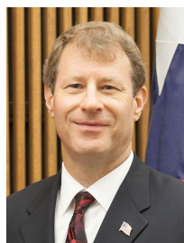
Managing Partner The Timaeus Law Firm, PLLC

WWW.POSTOAKBANK.COM 55 INTERSTATE 10 N. BEAUMONT, TX 77707