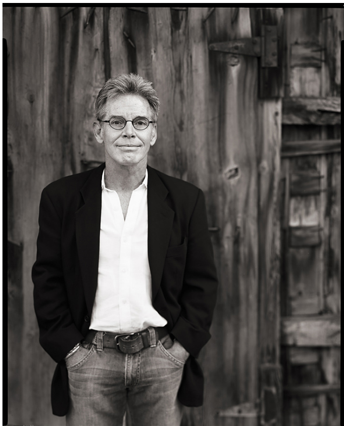
Keith Carter Photographer

From Flannery O'Connor to Muddy Waters, "Myth, Magic, & Mojo" explores the ways myths and legends rooted in East Texas lore help give voice to creative expression and a rich cultural legacy.