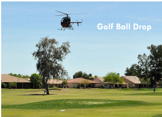
Golf Ball Drop