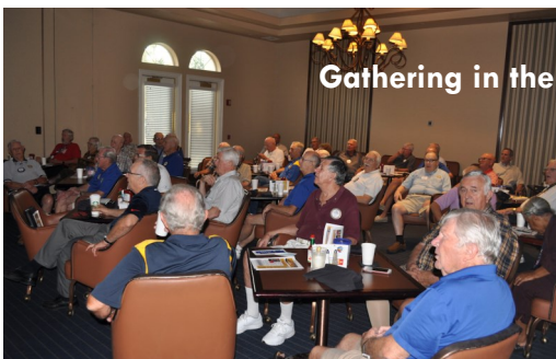
Gathering in the

A hundred things there are to say About what Rotarians do each day. In every land and every town To lift someone when they are down. And help each other along the way. "Service Above Self" . . . What more can I say?