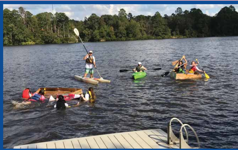
Rotary D 5910 Youth Exchange weekend at Crystal lake in Palestine, cardboard boat races and Ski Jaks.