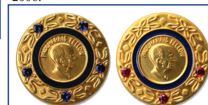
Left: Introduced in 1984, the blue-stone Multiple Paul Harris Fellow pin recognizes additional donations up to $5,000. Right: Red-stone Multiple Paul Harris Fellow pins were introduced in 1988 to bridge the gap between the blue five-stone pin and Major Donor recognition levels.

The number of Paul Harris Fellows reached the one million mark in 2006.