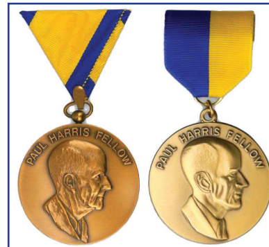
The first Paul Harris Fellow medallion (left) and a later version. Various lapel and neck ribbons were used with this medallion throughout the years.