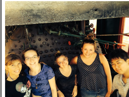
Galveston Youth Exchange