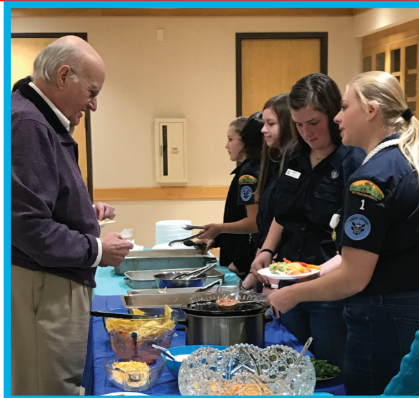
That Palestine Sea Scout Troop catered and served lunch to the Palestine Rotary Club on Jan. 3.