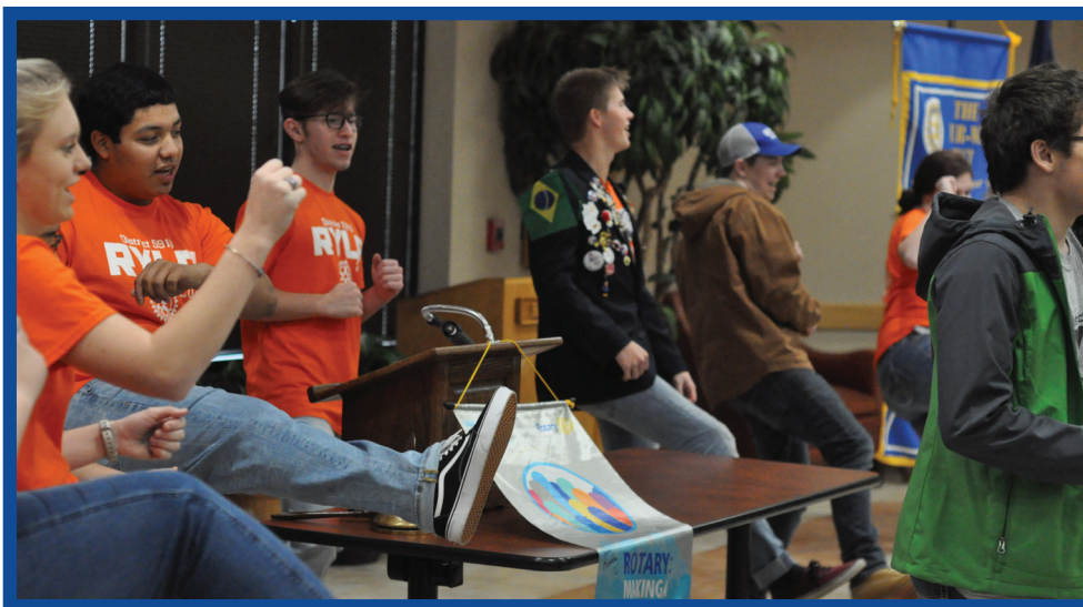
Students who attended RYLA perform several of the chants they learned during the Rotary Youth Weekend.