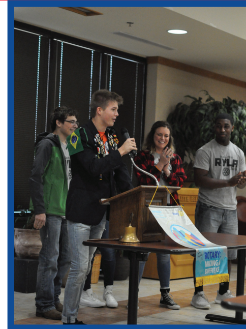
Students who attended RYLA share their memories and experiences with the Palestine Rotary Club.