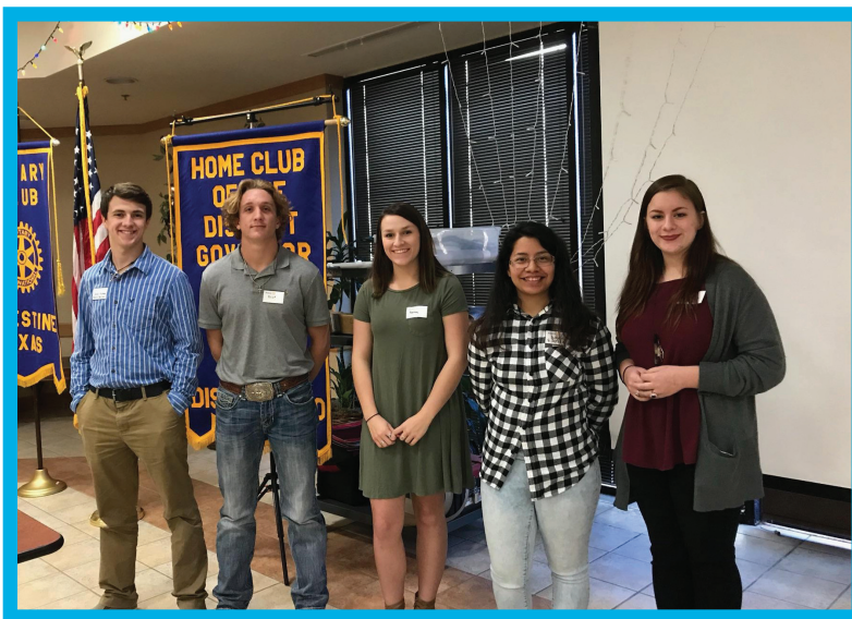
The Junior Rotarians for December shared a little about themselves with the club on December 20th.