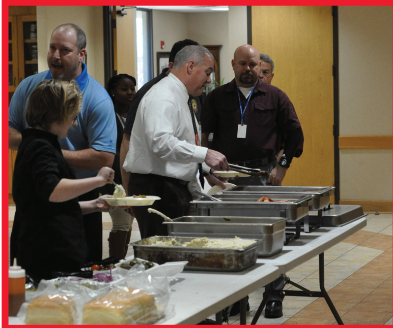
Palestine Rotary members and guests enjoy barbecue and all the trimmings from Bishop's on Jan. 24.