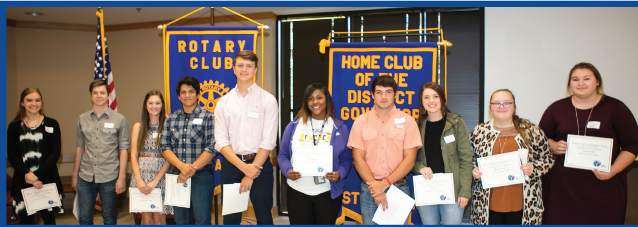
The Junior Rotarians for October shared information about themselves with the club.