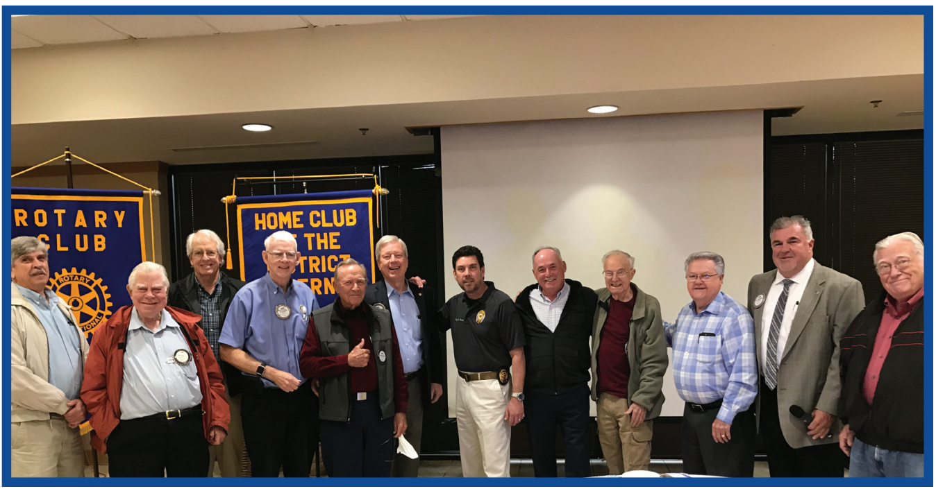
All former members of the armed services in attendance were recognized during the Palestine Rotary Club's Nov. 8 meeting in honor of Veterans Day.