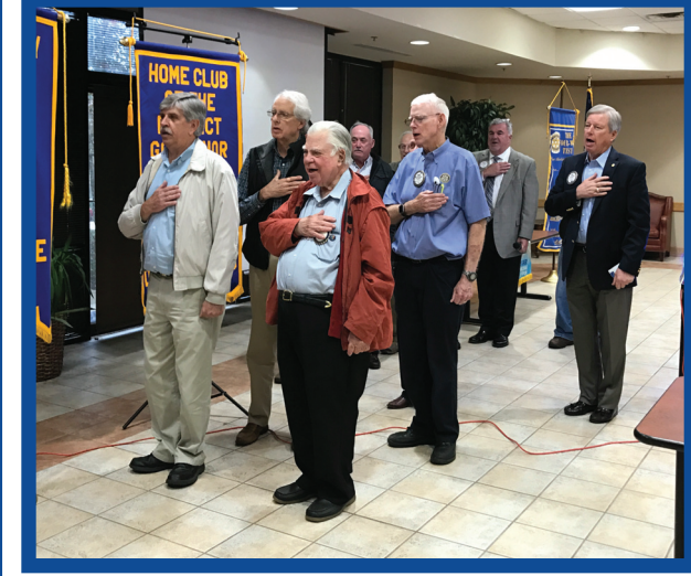
The former members of the armed services then led the club in pledges to the U.S. And Texas flags.