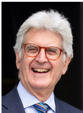
Francesco Arezzo Rotary Club Ragusa Italy

August is Membership Month, but our commitment to growth and connection is year-round. When we focus on growing Rotary, we grow our ability to serve, to lead, and to bring lasting change.