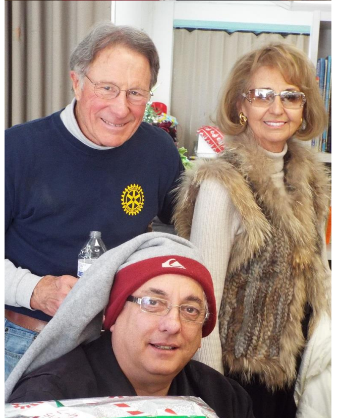
Merry Christmas to All and to All a Good Night!