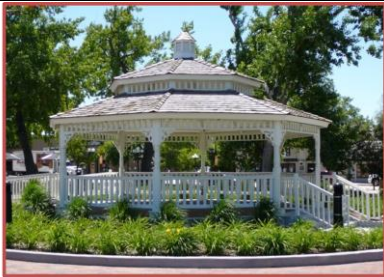
The Parker Rotary Centennial Gift to the Town of Parker – 2005