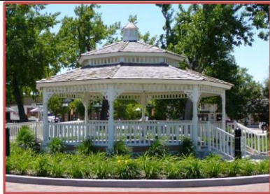
The Parker Rotary Centennial Gift to the Town of Parker – 2005

Join the Parker community in honoring Veterans at the annual Memorial Day Veterans' Service of Remembrance.