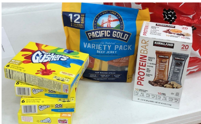
These are the items to buy and bring to next week's program: Support Our Soldiers.